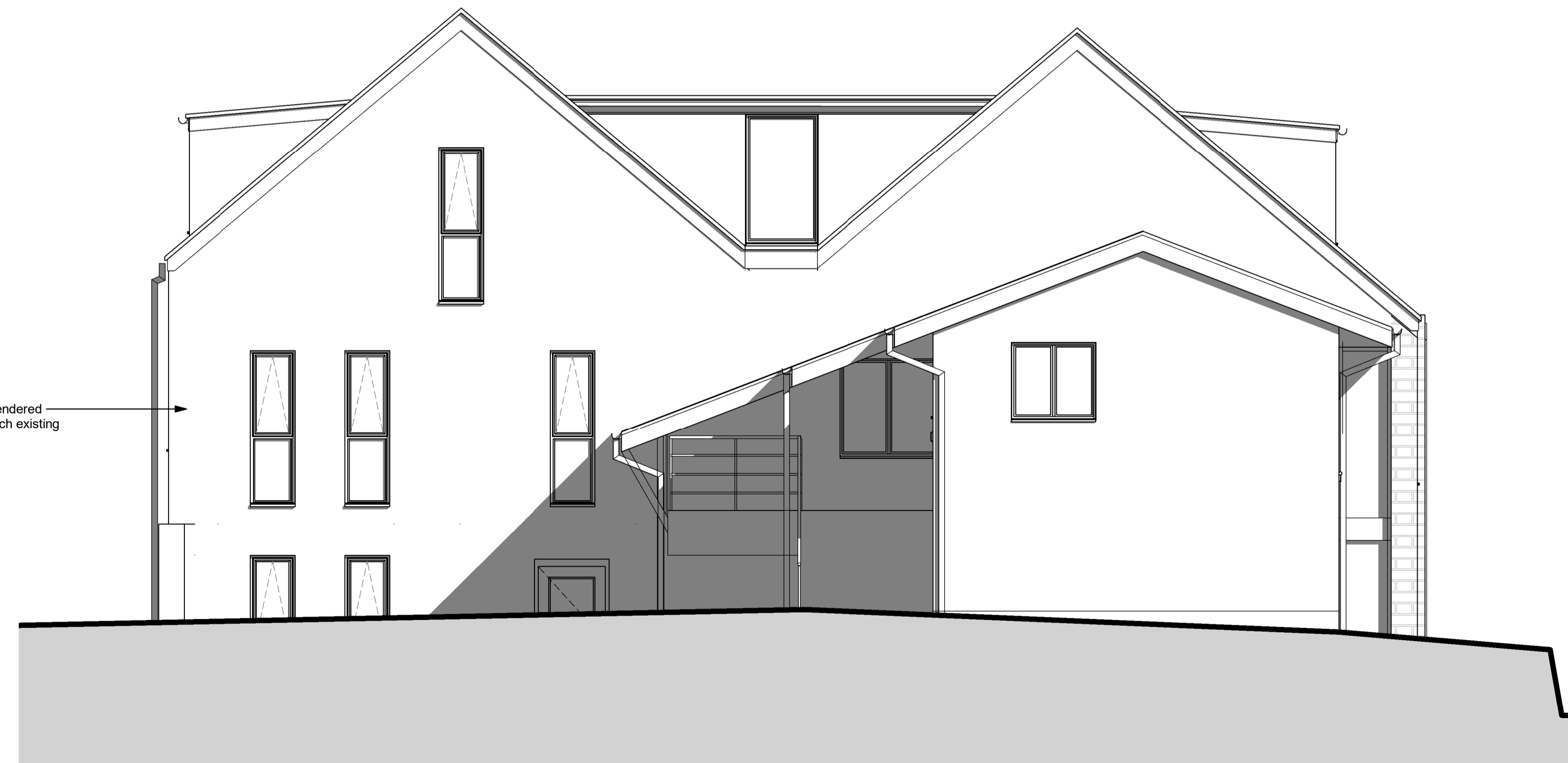
Proposed West Elevation

NOTES DO NOT SCALE. USE FIGURED DIMENSIONS ONLY. ALL DIMENSIONS TO BE VERIFIED ON SITE PRIOR TO THE COMMENCEMENT OF ANY WORK OR THE PRODUCTION OF ANY SHOP DRAWING. ALL DISCREPANCIES TO BE REPORTED TO THE ARCHITECT. THIS DRAWING IS TO BE READ IN CONJUNCTION WITH ALL RELATED ARCHITECTS AND ENGINEERS DRAWINGS AND ANY OTHER RELEVANT INFORMATION. THIS DRAWING IS COPYRIGHT © OF DWA ARCHITECTS (LONDON) LTD.