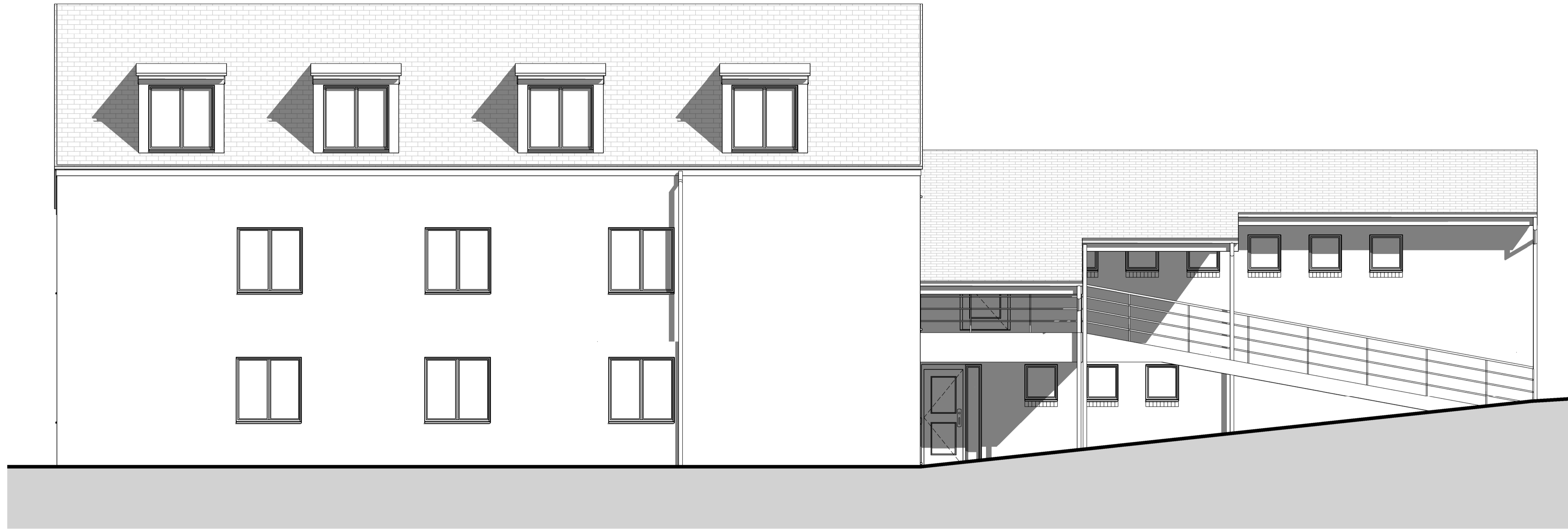
Proposed North Elevation