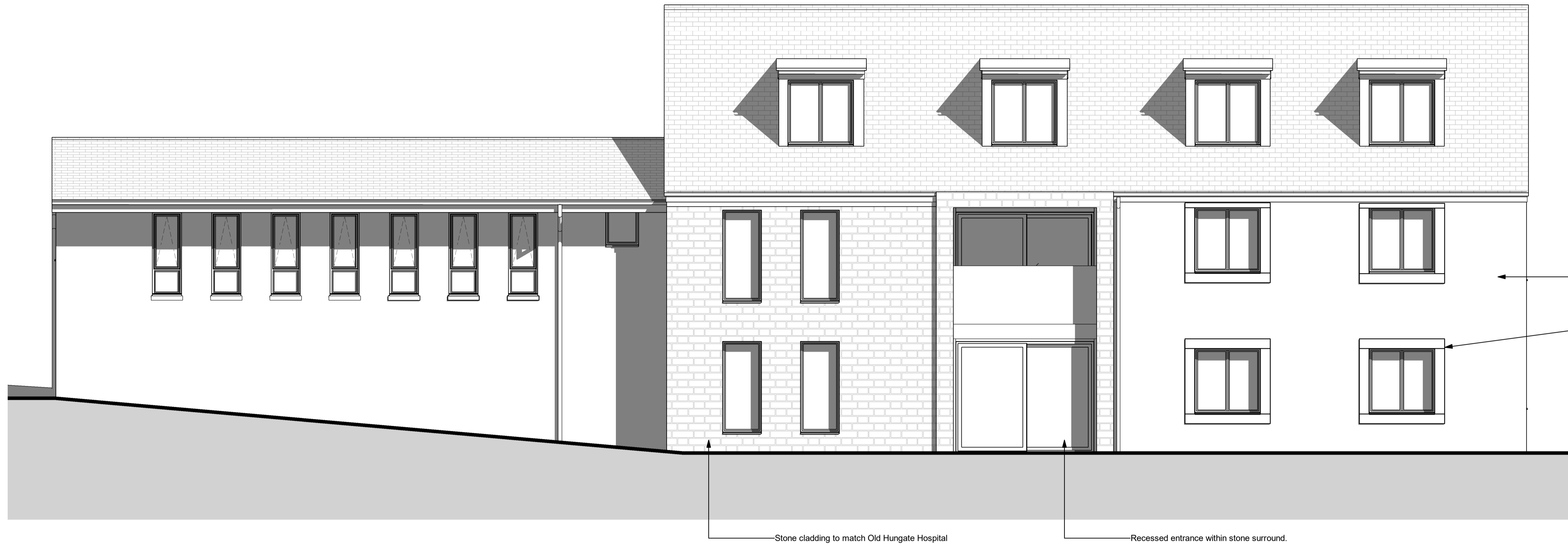
Proposed South Elevation